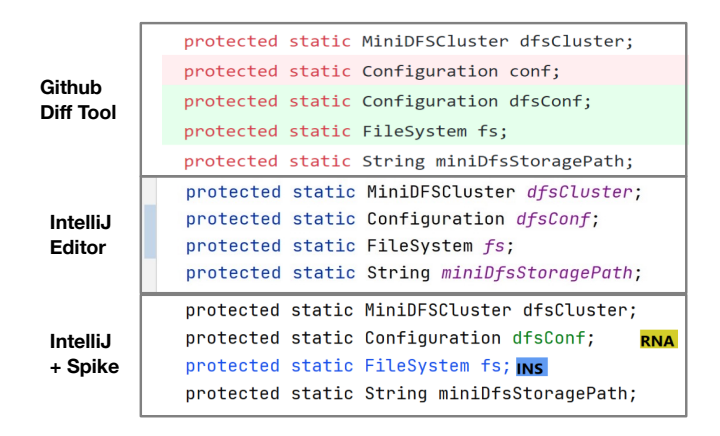
Fig. 1. Source code change example in: GitHub, IntelliJ, and Spike

Alexandre Bergel RelationalAI Switzerland https://bergel.eu